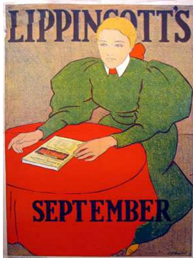
Cover of Lippincott's Magazine