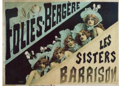
Ad for the Sisters Barrison's show